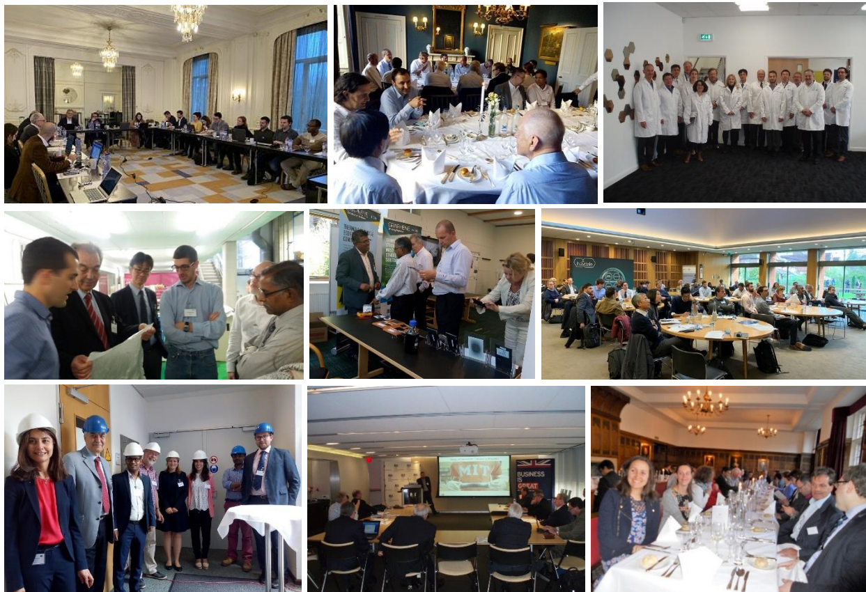
NCEM Consortium Meetings, Lab Visits and Dinners

The NCEM meetings are often hosted at one of its members' sites at a leading research institution with the tour of laboratories: MIT, Boston (NCEM-2.5), University of Cambridge , Cambridge (NCEM-4.1), Fraunhofer IPA , Stuttgart (NCEM-1.4), CRANN Trinity College Dublin, Dublin (NCEM-1.5 & NCEM-2.4), AIRBUS Defence & Space, Stevenage (NCEM-3.2), Schneider Electric , Grenoble (NCEM-3.1), Graphenea , San Sebastian (NCEM-2.2), Cambridge Nanosystems , Cambridge (NCEM-3.5), Rice University , Houston (NCEM-4.2) and IIT , Genoa (NCEM-4.3), The Joint Institute for Innovation Policy and Nanocyl Brussels (NCEM-5.3), Tecnia , San Sebastian (NCEM-5.5). Prysmian Group , Milan (NCEM-6.1), Fraunhofer IVV , Freising (NCEM-6.2), LEITAT , Spain (NCEM-6.4) and EMPA , Thun (NCEM-6.5).