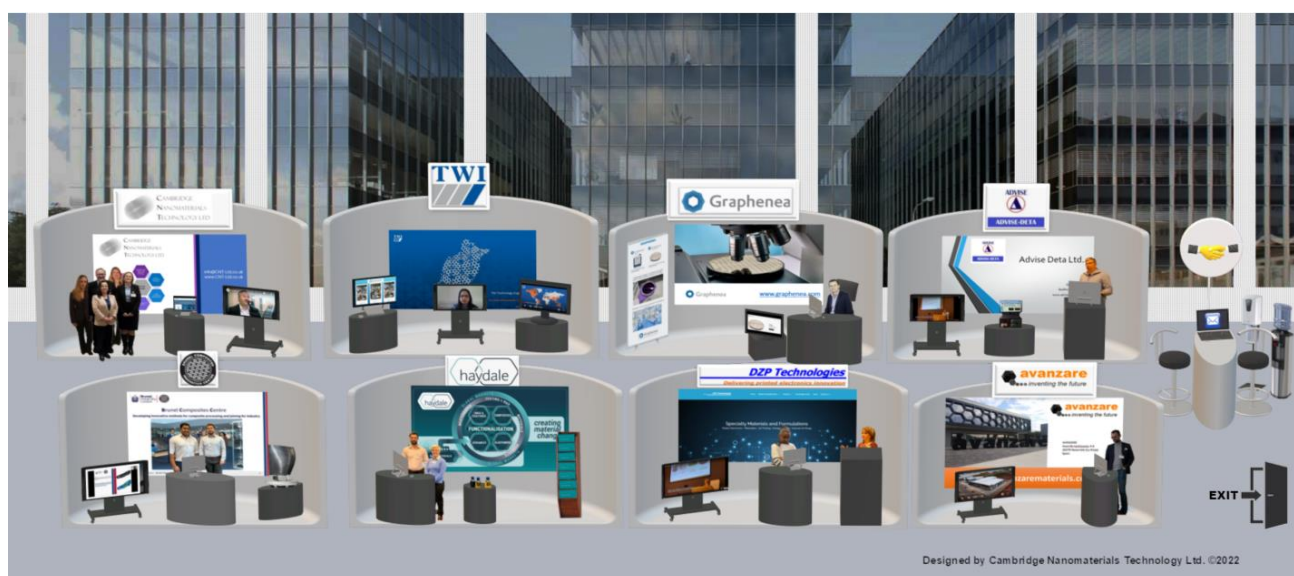
NCEM related graphene virtual exhibition platform

Cambridge Nanomaterials Technology Ltd has been building community virtual exhibition platforms as a result of the COVID-19 pandemic travel and social distancing restrictions and continued following the pandemic restrictions ending in order to provide additional and complementary tool for community building and support. Currently we have 10 platforms under umbrella of the central nanomaterials nanoMAT platform ( www.nanoMATexpo.net ). Platforms are directly related to nanomaterials community such as GRAPHENEXPO platform ( www.graphenexpo.net ), energy applications including two platforms on renewable energy Solar Power ( www.SolarPowerExpo.net ) and Wind Power ( www.WindPowerExpo.net ) and Carbon Capture and Utilisation platform ( www.carboncaptureexpo.net ). Further platforms have been built supported by various government projects related to topics such as materials charatersation, circular economy, medical devices, and regenerative medicine applications. All of these platforms are available to the NCEM. Platforms related to batteries, packaging, nanoelectronics and 3D printing for biomedical applications are being developed in various ongoing projects or communities developed related to this applications are incorporated into the existing platforms.